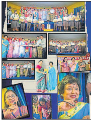
The students as well as the teachers were felicitated during the event