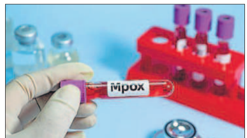
First mpox Clade 1b case was reported from Kerala's Malappuram last week

Those arriving from the nations where the infection was reported have been instructed to report at the airport if they develop any symptoms, she said. As soon as the outbreak of the mpox was reported in 2022, the southern state had brought out a Standard Operating Procedure (SoP) in this regard. PTI