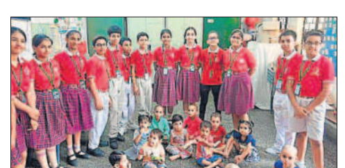
The visit to the orphanage made the students aware about the lives of children with disabilities

children's needs, & the challenges they face. The school also organised a donation during which students distributed biscuits and chips among the children there. It helped them build a sense of sharing among students. They learned to share their privileges with the children who are less privileged.