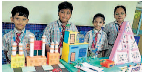
Students participated in the exhibition with great enthusiasm and showcased their artistic skills

The primary wing of AVB Public School, IP Extension, organised an art and science exhibition, which commenced with the lighting of the ceremonial lamp. Students took part in the event and showcased models of natural phenomena, such as water cycle, plant life cycles, food chain, photosynthesis and many more.