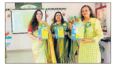
The seminar stressed on adopting sustainable practices to mitigate the impacts of climate change & pollution

Eco Club, presented the eco report, summarising the achievements and progress of the initiatives and endeavors undertaken by the school throughout the session.