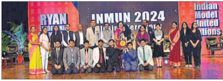
The delegates from various Ryan schools participated in the MUN conference

The conference provided a platform for delegates to experience the complexities of international relations and develop leadership, public speaking, and negotiation skills. Dur-