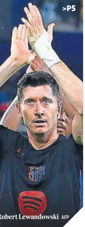
Robert Lewandowski