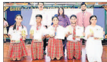
Students took part in a series of intra-school contests during the celebration

Queen Global International School, Dilshad Garden, celebrated its 10th Founder's Day 'ANUJYOT'. Referred to as 'Globalites,' the students took part in a series of intra-school competitions like elocution, storytelling, recitation, poster & logo designing, and fancy dress, which allowed them to showcase their artistic talents.