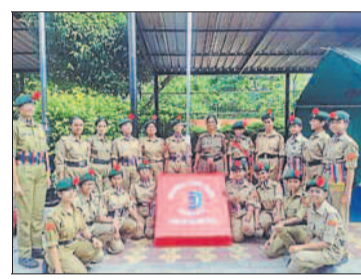
The team of Universal Public School secured the first position in in-line area and nukkad natak events