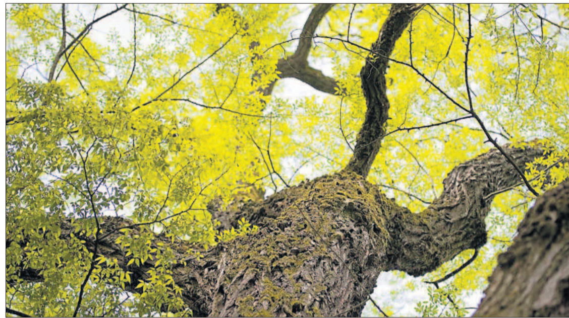
Introduced plants often differ in their characteristics from native plants, meaning they can provide new roles or replace the roles formerly served by native plants. For example, the introduced Siberian elm (in picture) has adapted well to river areas that are now too dry for native elms. The introduced elm has been found to contribute similar roles in the community, like photosynthesis and providing wildlife habitats.