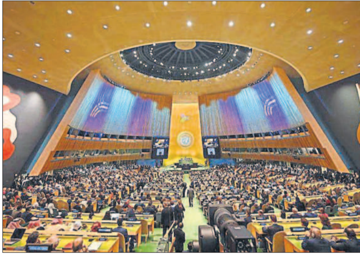
A view of the General Assembly Hall at the opening of the Summit of the Future on the sidelines of the UN General Assembly in New York, on Sunday.

Russia has made significant inroads in Africa — in countries like Mali, Burkina Faso, Niger and Central African Republic — and the continent's rejection of its amendments along with Mexico, a major Latin American power, was seen as a blow to Moscow by some diplomats and observers.