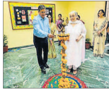
The competition was organised in both online and offline modes

The competition culminated with the prize distribution ceremony which was judged by a panel of distinguished judges called in from different fields for their expertise and skill. The felicitation ceremony was followed by a cultural programme presented by Nrityamanjari, the dance troupe of the school.