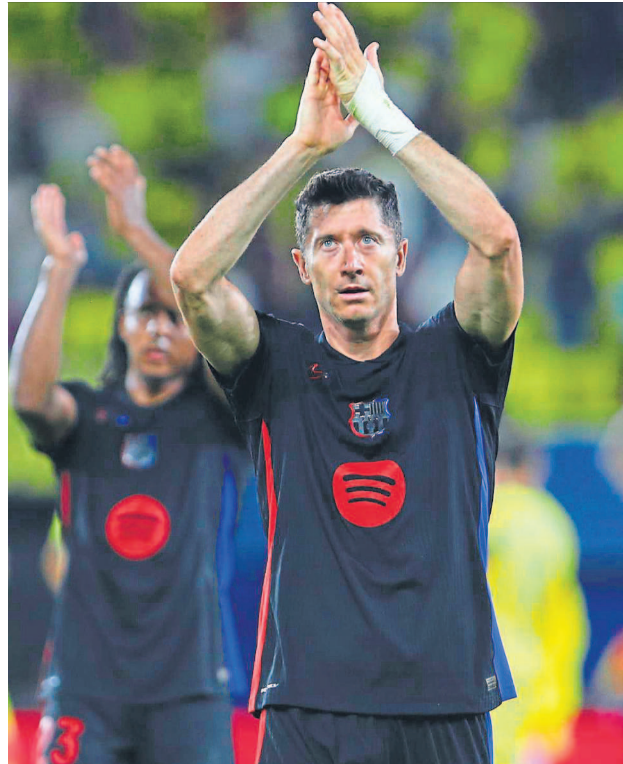
Barcelona's Robert Lewandowski celebrates at the end of a La Liga match against Villarreal in Villarreal.

It was his sixth La Liga goal of the season, taking him two clear of Real Madrid's Kylian Mbappe in Spain's