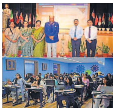
More than 200 delegates from various schools in Delhi-NCR participated in the school's fifth MUN conference