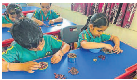
The experiential learning forms the cornerstone of students' educational approach at the school

These hands-on experiences not only deepen students' understanding of academic subjects but also foster critical thinking, problem-solving skills, and a sense of curiosity.