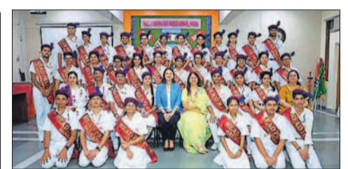
The event's highlight was the pinning of badges & adorning of sashes to the elected council members

The event ended with the award ceremony. DPS Indirapuram won both the Best School Delegation and Best School Participation awards.