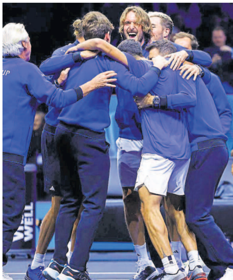
Players of Team Europe celebrate after winning the 2024 Laver Cup in Berlin, Germany. Team Europe won 13-11 against Team World.