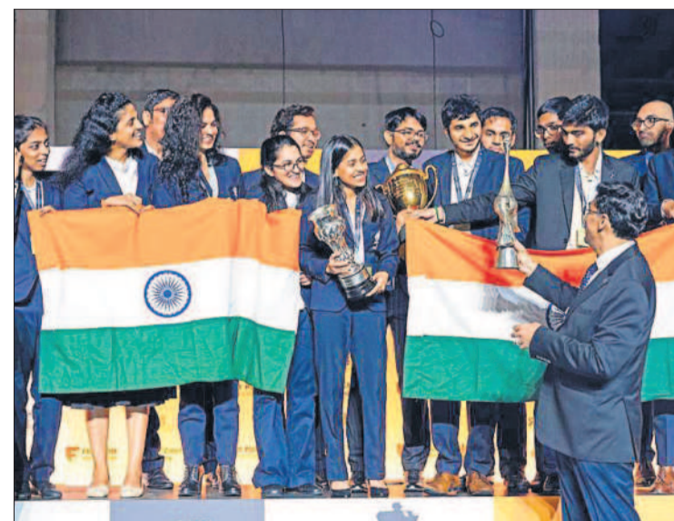
Indian teams on the podium at the 45th Chess Olympiad in Budapest.

The women too won gold and both the teams were seen jumping with joy at the podium. Another key contributor to the men's success was Arjun Erigaisi, who scored 10 points playing all the 11 games in the event. He has now elevated himself to num-