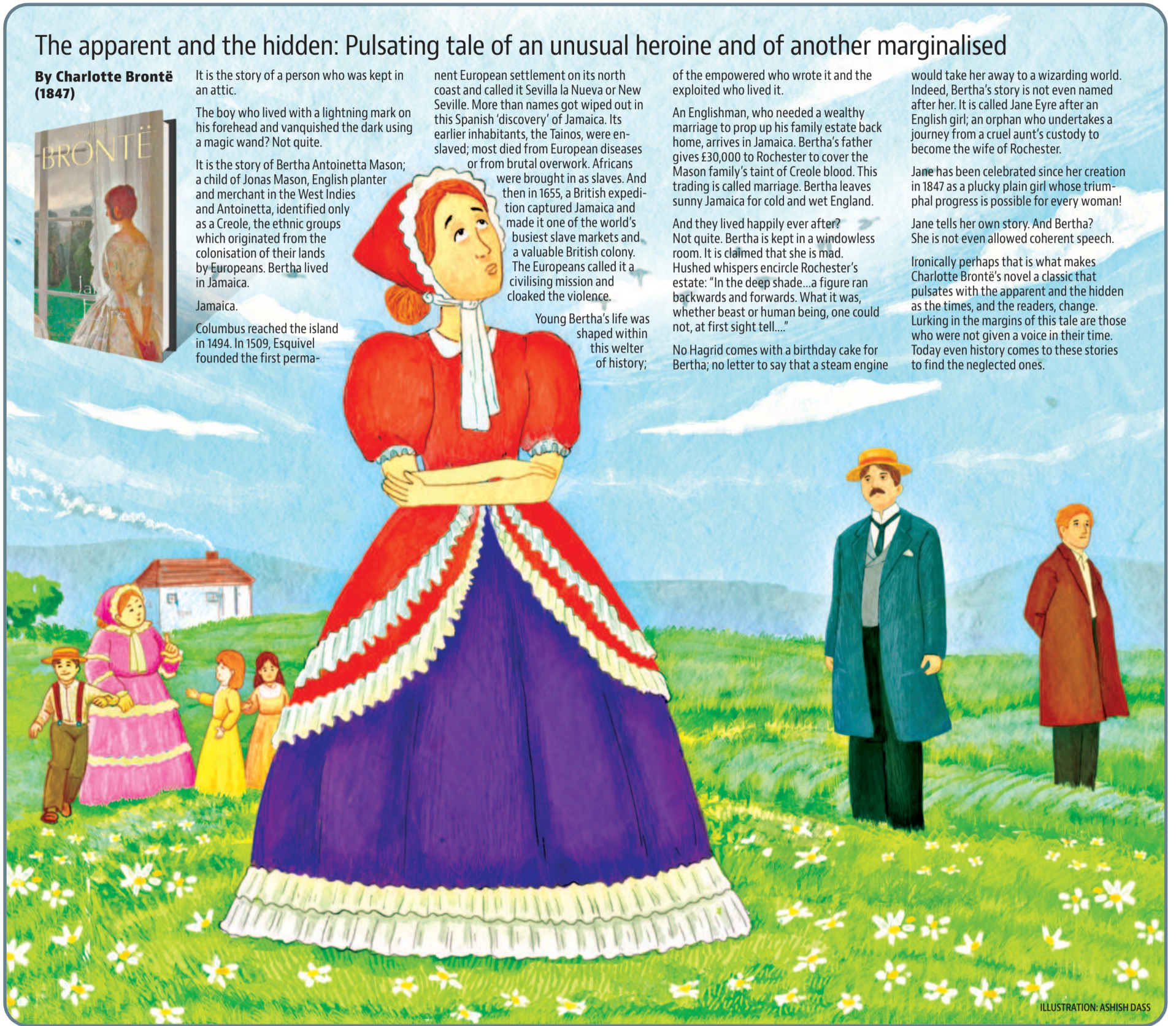
ILLUSTRATION: ASHISH DASS

Ironically perhaps that is what makes Charlotte Brontë's novel a classic that pulsates with the apparent and the hidden as the times, and the readers, change. Lurking in the margins of this tale are those who were not given a voice in their time. Today even history comes to these stories to find the neglected ones.