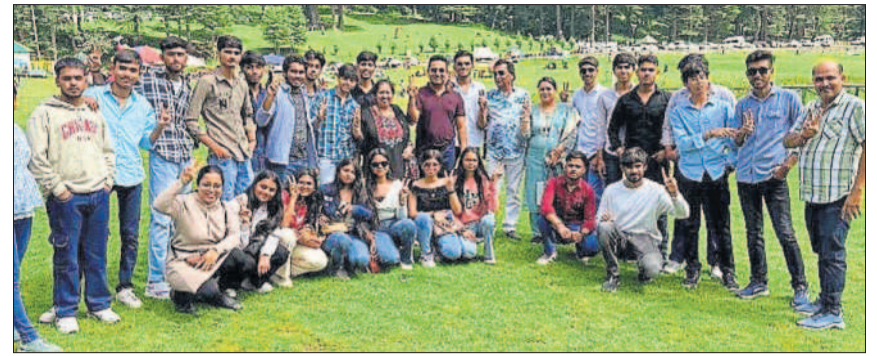
The tour turned out to be a fun-filled and enriching experience for all the participants

CATC witnessed the participation of cadets from various schools and colleges. The UPS cadets underwent extensive training in key army subjects, including weapon training, firing, tent pitching, map reading, army history, and the heroic deeds of war heroes. Several guests conducted sessions on cyber security, e-waste management, POSCO Act, tips for cracking SSB and NDA examinations, as well as pathways to joining the defence forces and civil services. UPS takes pride in its students' remarkable accomplishments at the CATC.